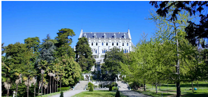
The Building I saw in the dream.